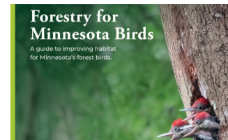
Forestry for Minnesota Birds Conservation Guidebook