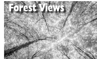
Forest Views 3: Between Fern Gully and Fiber Farms