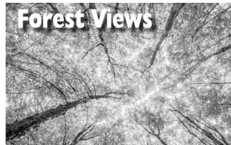
Forest Views 2: Forest Ecology and Timber Harvesting