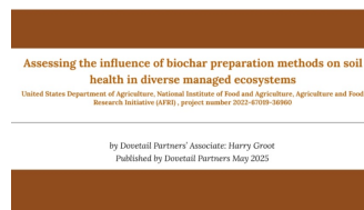
Assessing the influence of biochar preparation methods on soil health in diverse managed ecosystems