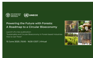
Bioeconomy Publication Launch