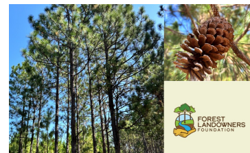
U.S. Forest Sustainability in the 21st Century