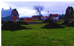
Biochar's Impact on Soil Health - StoryMap