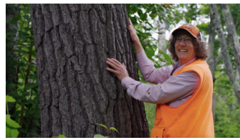
Rooted in the Future Video