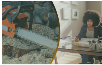
Workforce Needs & Challenges in the U.S. Forest and Wood Products Sector and the Value of Diversity, Equity, and Inclusion