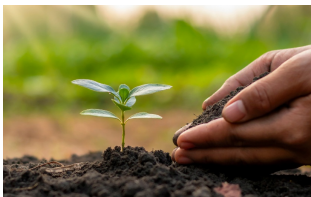
Dovetail intern reflects on attending soil health summit