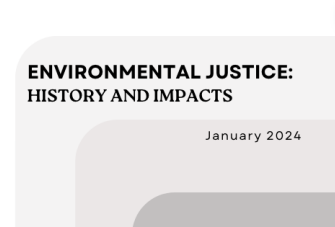
Environmental justice: History & impacts