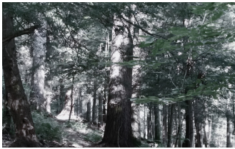
Old Growth Guest Responses

Please take the time this month to catch up on any of the articles you may have missed along the way as we reach the half-way point in 2024.