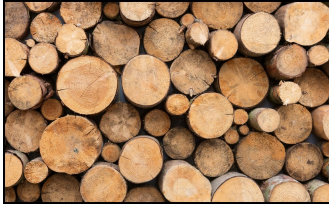
Do You Export to Europe? Urgent Attention to EUDR Needed