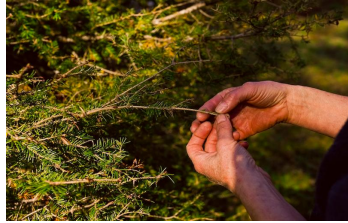
Community Partners Initiative (CPI)