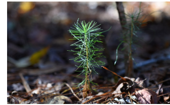
Concept Paper: Exploring the Potential Effects of an Expanding Forest Carbon Market on Working Forests and Communities in the United States