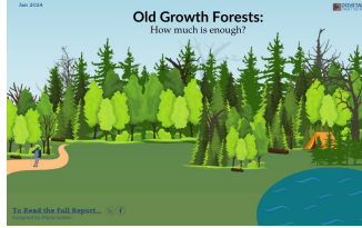
Old growth key takeaways