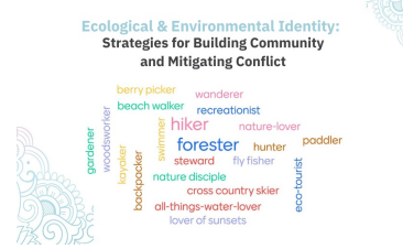
Ecological & Environmental Identity: Strategies for Building Community and Mitigating Conflict