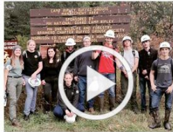
Central Lakes College Natural Resources Program