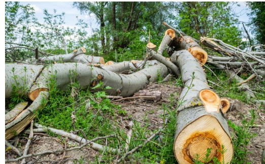
Deforestation: Definitions, Trends, and Policies for Forests and Forest Products