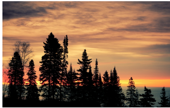
Who's Your Hero? Finding Community Leaders in Fire-Adapted Northeastern Minnesota