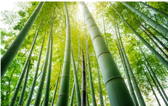
The Economic Importance of Credible