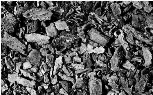
Ongoing Biochar Research: Into Ecological and Economically Sustainable Applications in Small and Mid-size Managed Ecosystems

Please take the time this month to catch up on any of the articles you may have missed along the way as we reach the half-way point in 2023.