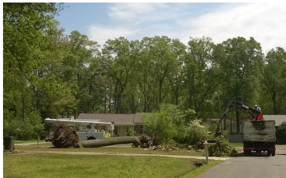
The Accessible Community Tree Inventory: