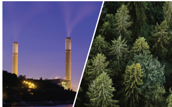
Carbon Capture Technologies and Natural Climate Solutions: 1+1 = 3