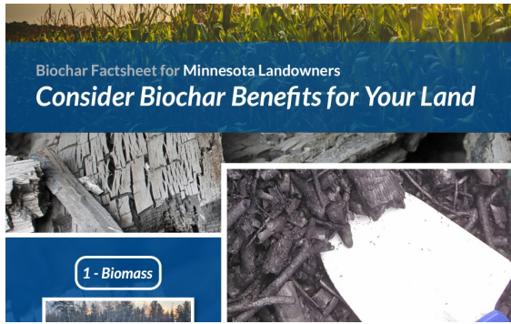
Biochar Factsheet: Consider Biochar Benefits for Your Land