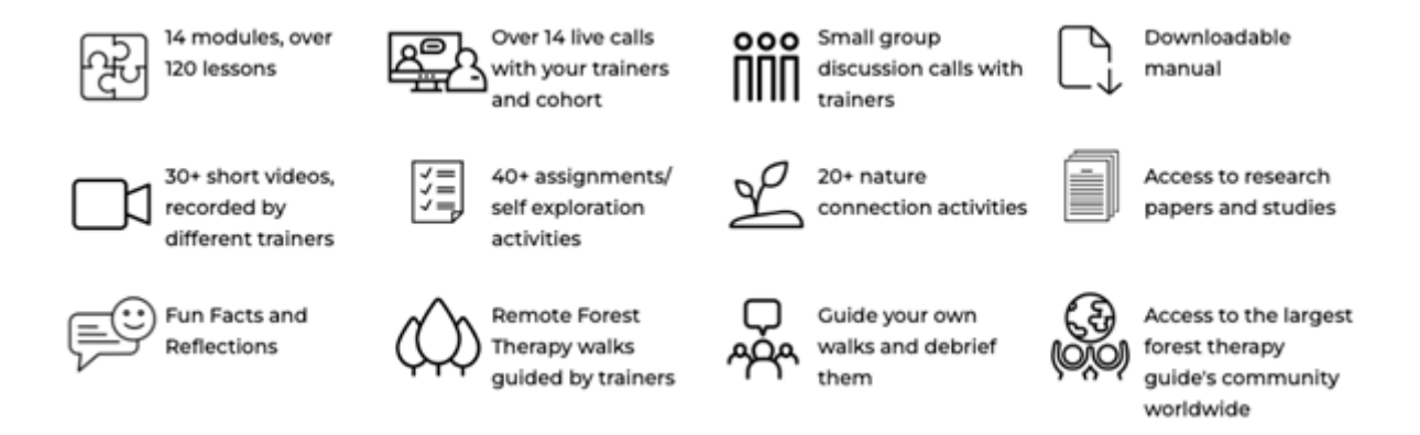
Figure 2. ANFT Certified Forest Therapy Guide Training Materials, Experiences, and Resources