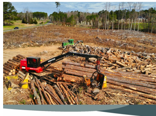
Logger Engagement and Retention: Surveying what matters in a quality logging operation across the U.S.