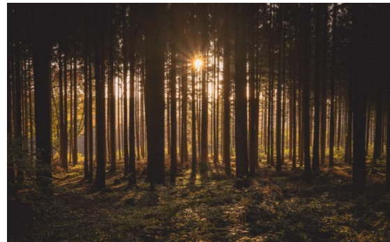
The Forest Certification Experience - A Commentary by Dovetail Partners