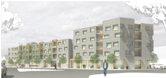
Affordable Housing Opportunities with Mass Timber