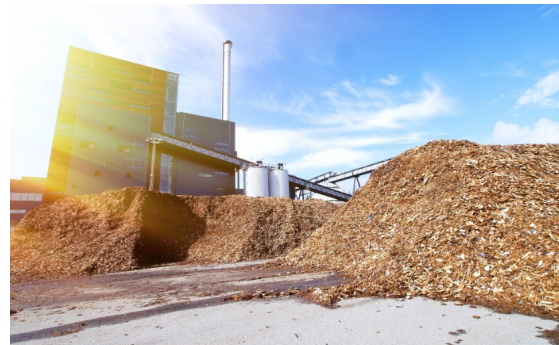
Biomass Energy: A Climate, Conservation, & Livelihoods Challenge