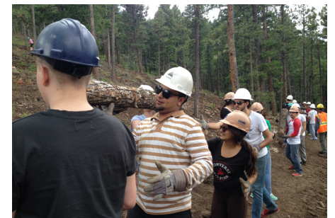
Learning together and working together: Field tours like the one near Orleans, CA (top), bring together residents, NGOs and agencies to learn from recent wildfires. Community work days, like the one near Woodland Park, CO (bottom), let “many hands make light work” while strengthening community ties.