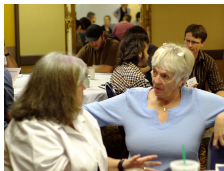
In 2014, the Network met in Colorado Springs for several days of presentations, discussions, a field tour with the Fire Learning Network—and plenty of one-on-one networking.

In addition to netweaving, core team members support the deployment of a variety of local FAC tactics and strategies, and harvest learning from them. Capturing the network’s learning, they